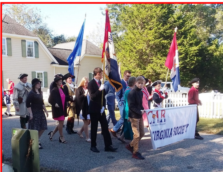
C.A.R. members in a parade in Yorktown, Virginia