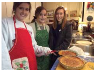
Success! Now they can eat them