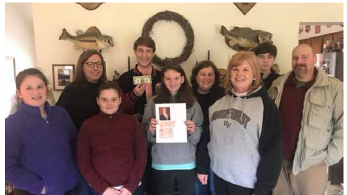
Governor Alexander Martin members & seniors at January meeting. Welcome New Members!!