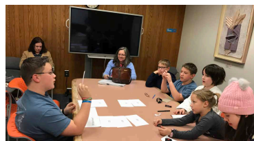
State Treasurer presents a program on "How Money is Made"