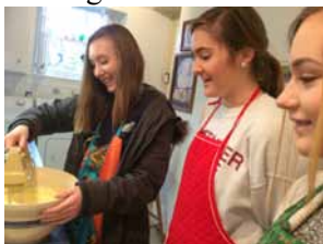
Making the buttermilk pies