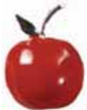
$1,000 Red Apple Pin

Support the C.A.R. Museum. Make a donation to The Children's Room or Museum and receive one of these pins: