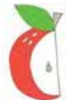
$50 Apple Slice Pin

Proceeds will support the State President's Project "Common Threads in a Shared Tapestry" to raise funds to purchase "Learning Backpacks" for the Museum of Southeast American Indian at UNC-Pembroke.