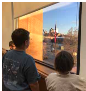
When you forget the flag you get creative! There's one outside!

Greetings all! The Isham Blake society has been busy completing our Chaplain's project—over 100 graves photographed! Members will present their program at the February meeting. We spent January listening to a presentation from our State Treasurer on "How Money is Made", including playing a Jeopardy game after learning all the facts. Our Senior Society president then gave a presentation on how tar is made and members and prospectives learned about the Long Leaf Pine tree.