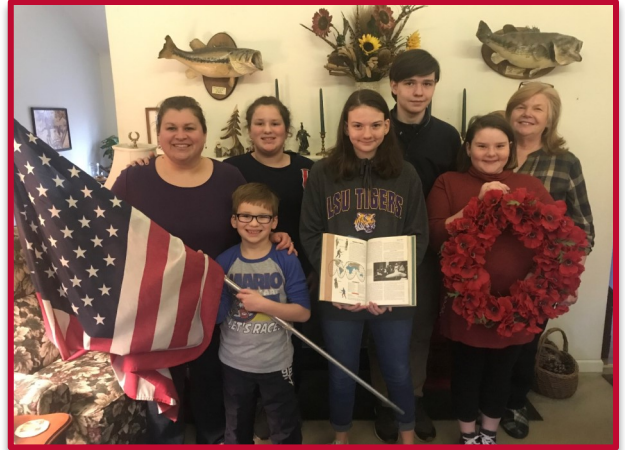
Members of the Governor Alexander Martin Society